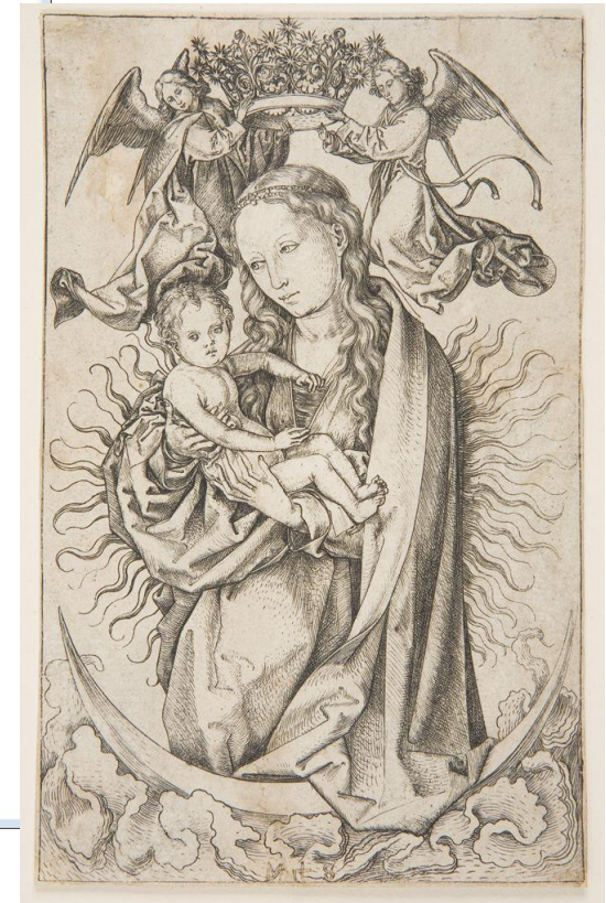
Martin Schongauer, Madonna on the crescent, c 1480