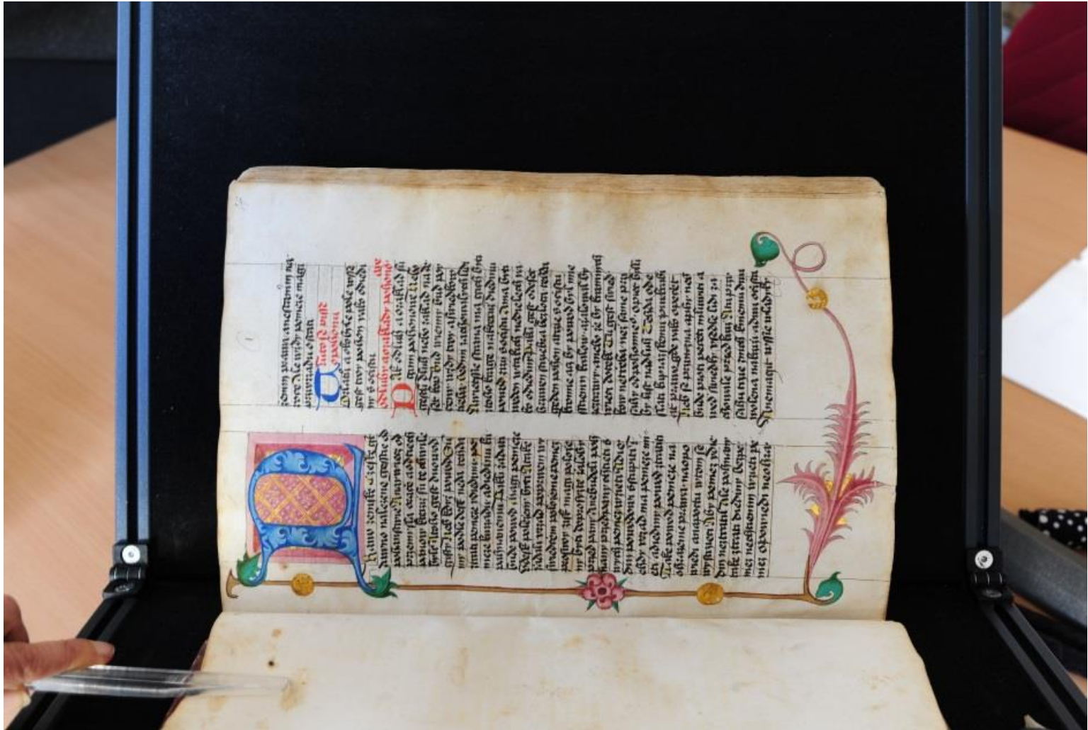
Digitizing manuscripts with special equipment („Bücherwippe“)