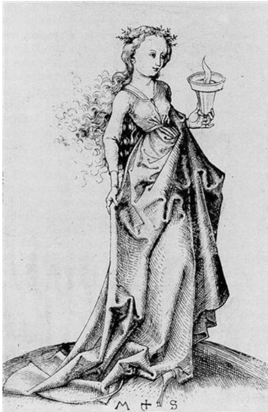
Designing ornaments and figures with the help of model books and prints (Schongauer a.o.)