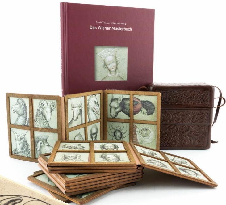
„Wiener Musterbuch“, KHM © Facsimile Müller & Schindler